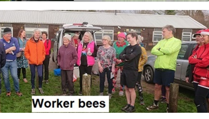
OnON ... TFD