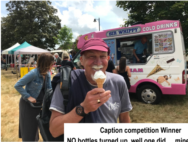
Caption competition Winner NO bottles turned up, well one did ... mine (that's a pint you owe me RHUM! ) "Moustache? MOUSTACHE? WHAT Moustache?"