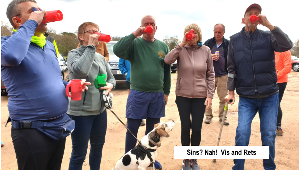
Sins? Nah! Vis and Rets