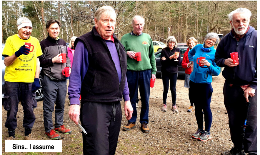
Sins.. I assume