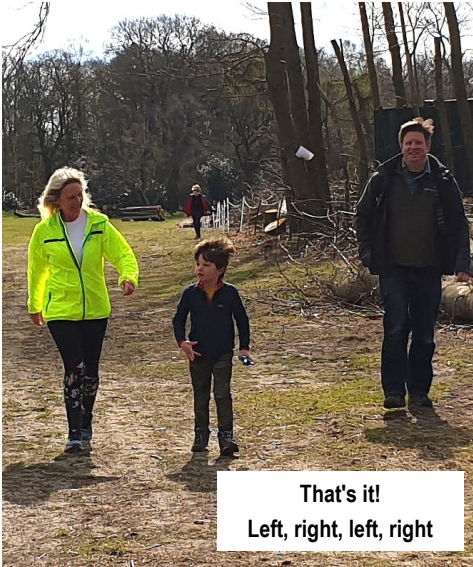
That's it! Left, right, left, right