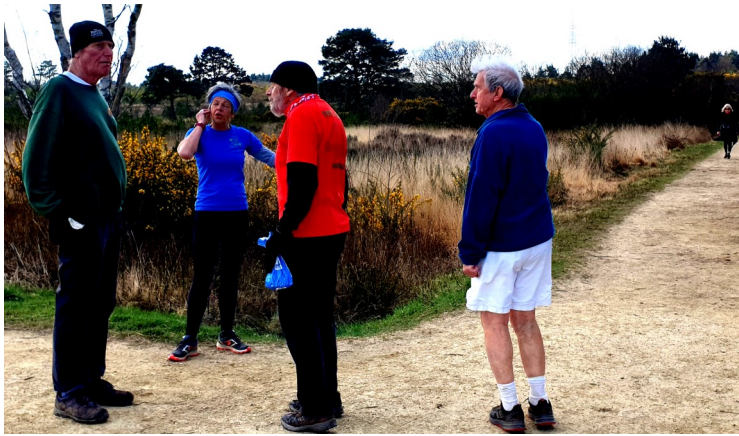
Caption competition..... Answers on a postcard please.