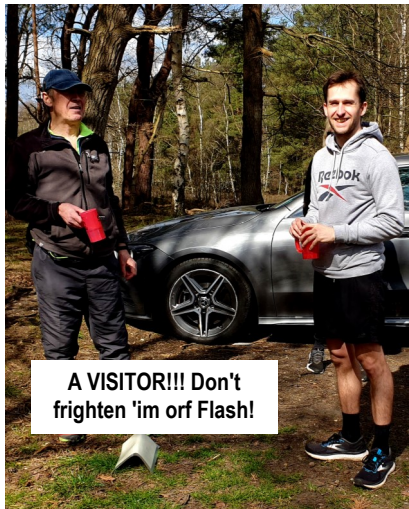
A VISITOR!!! Don't frighten 'im orf Flash!