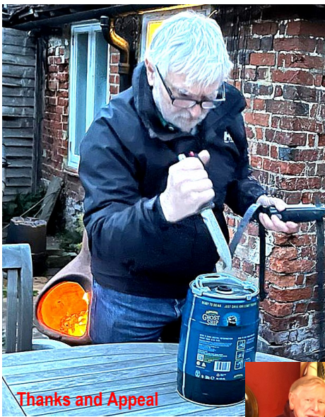
Thanks and Appeal