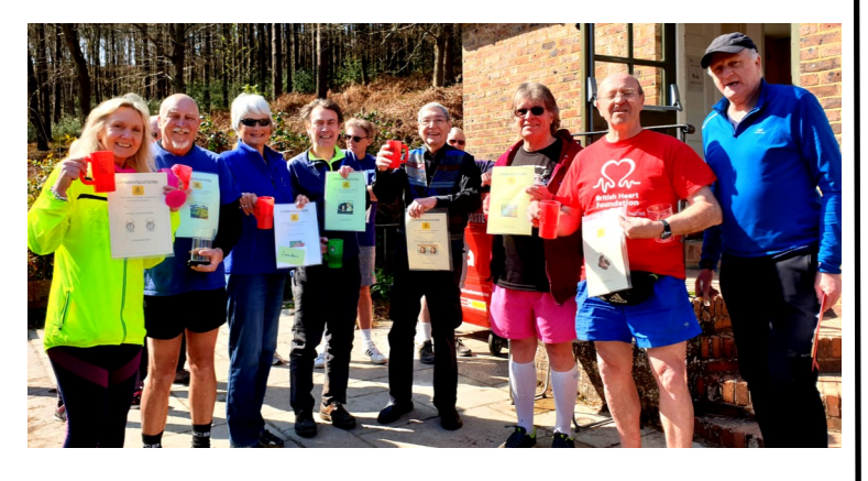
Le Pro's Special Awards .... Derrrr... Don't ask me!