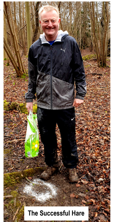
The Successful Hare