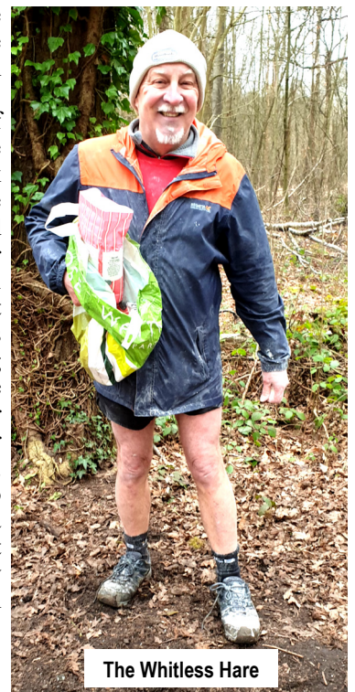
The Whitless Hare