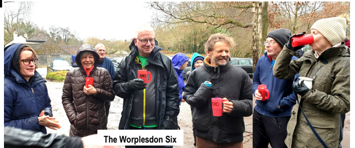
The Worplesdon Six

Note: website www.surreyh3.org for on-line details