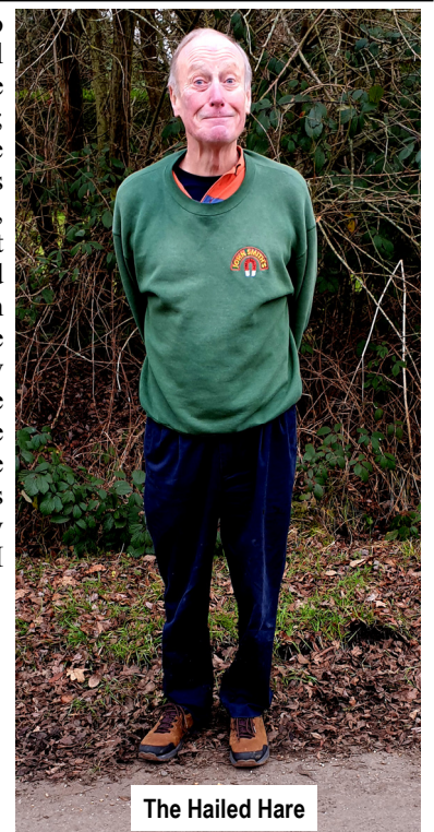
The Hailed Hare