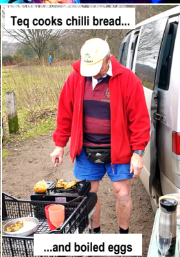
Teq cooks chilli bread...