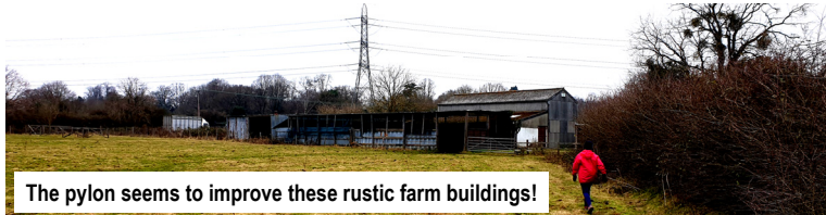
The pylon seems to improve these rustic farm buildings!