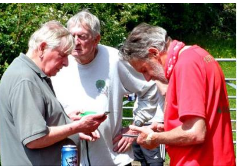
Blimey! What are these natty things?