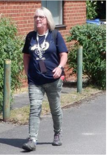
The hare: sun brings her out from under the duvet