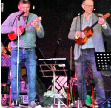
Anarchy in the UKelele