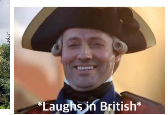
Bribes in the Wood

When you realise everyone in the Marvel Universe speaks English, which means that Britain must've colonised the entire universe