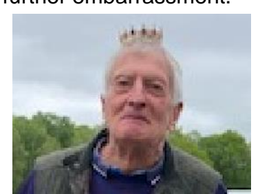
On-on, 'King Tosser

And for those of a more serious frame of mind, there is surely anyway, who likes their RS serious, informative and factual, apart from the initial FU endlessly running round trying to find flour and the next 30 minutes of wading through knee deep shiggy, it turned into quite а good run. Perhaps fortunately, our recently crowned GM got diverted from asking the pack, who may not all be so charitable, to voice to give their opinions on the run, thereby saving the hare further embarrassment.