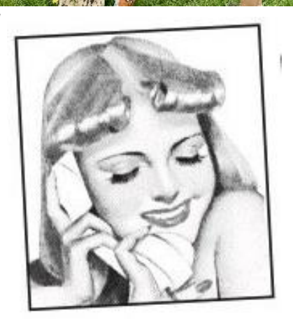
STOP PRESS!!!! GLENDA SLAGG Fleet Street's Finest She tells it like it is!!!

BODS -Fecking hell. what's going on? Old Baldy gets off his private jet, no doubt having bonked the trolley dolly, and starts throwing flour everywhere but the start. What a cock-up!