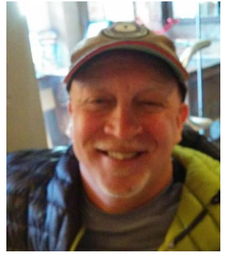
The jet-lagged hare