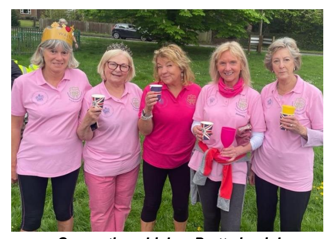
Coronation chicks - Pretty in pink

Think folks! Our illustrious Beer Fetchers go to great lengths to acquire our libations for each Sunday, so PLEASE LEND A HAND when it comes to getting the table and weighty items from the car boot.