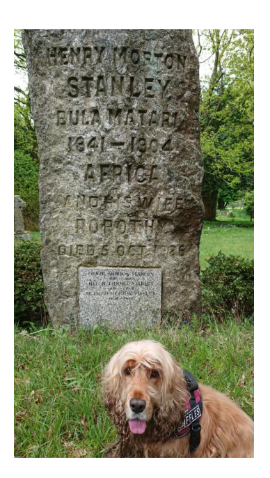
Taking a picture - honestly!.....This one