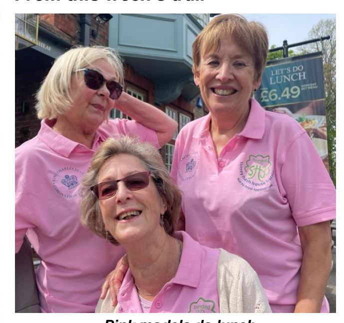
Pink models do lunch (not by Royal Appointment)