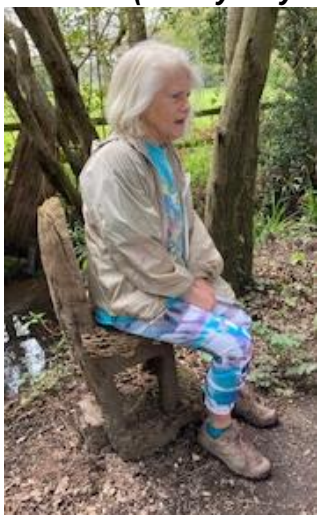
Arfur Pint-sized seat