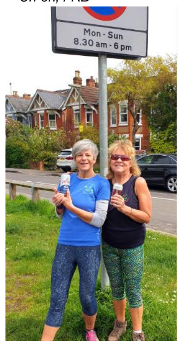
Parking challenged haresses