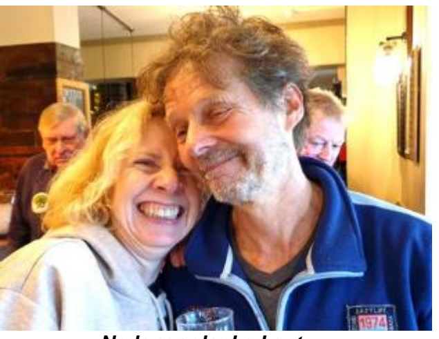
No longer locked out

This week's trail Mayford Commor Sutton Green