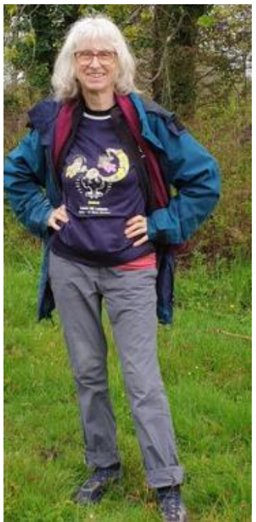
The Hare Raising Hare

suggests disapproval as some of us Brits seem to do. We tend to say "Charity begins at home" as if it were а respectable quotation. perhaps from the Bible. It is not from Holy Writ. It is pure selfishness, an attempt to our own justify baser instincts. (The first letter to Timothy has been evoked here: but all it emphasises is our responsibility for our households, a different idea altogether). When did you last hear the original (18th C!) sentence in full: "Charity begins at home, but should not stay there"?