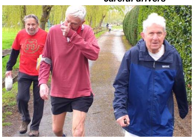
Something I said?