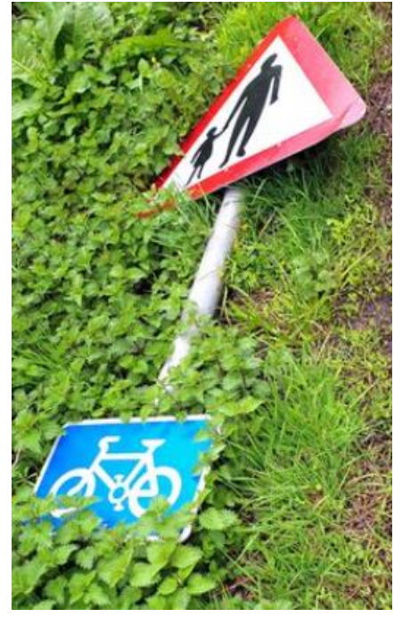
Mayford welcomes careful drivers