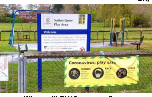
When will CV19 go away?