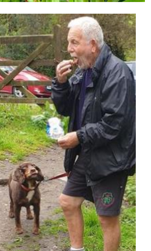
Dog treats taste nice