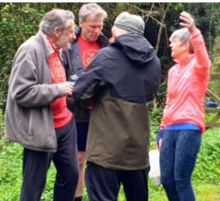
It was THIS big!