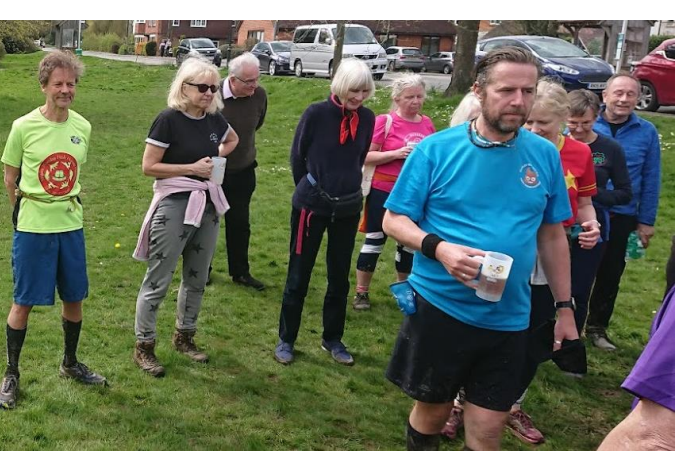
A CRAP visitor