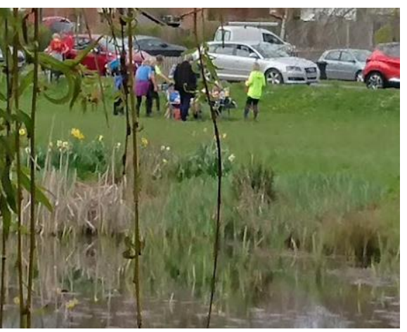
The On in