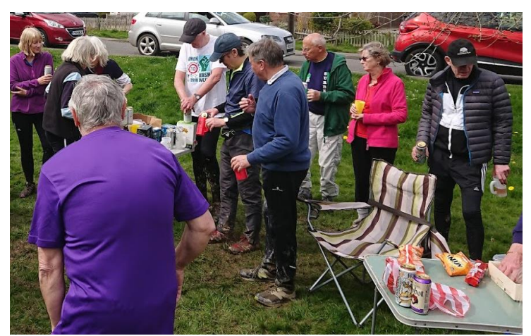
Who's in charge of the beer these days?