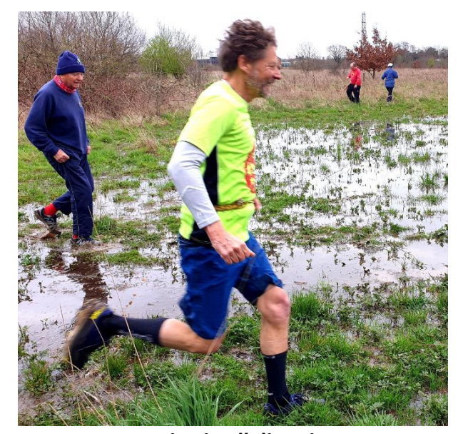
Running in all directions