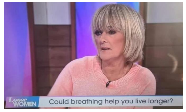
Might be worth a try...