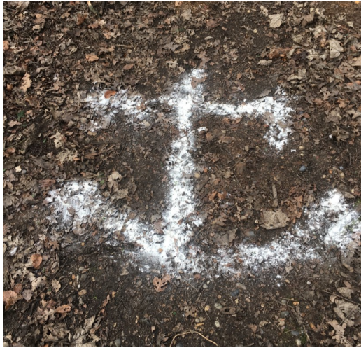
Popeye's HOME Anchor (age)