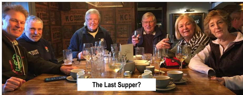
The Last Supper?