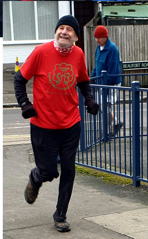
Saint J-Arthur (Rank) grins at his imaginary friend.