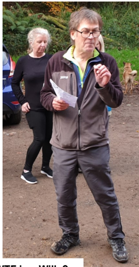
Spot the difference, AND... WTF is a Willy?