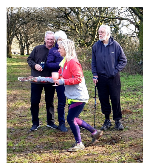
Random "Non" Horsey Pix