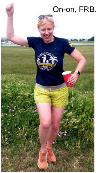
The hare celebrates

women first sought the vote: mav find vou this embarrassing. ("Suffragette" originally a word was invented by the Mail to mock vote-seeking women. The Times and the Telegraph were equally dismissive). I still recall the vicious hostility here in the fifties to legalising homosexuality. Anti-woke seems to mean Give people 50 years or more to change their ideas. Sometimes fewer: hostility to seat belts was short-lived. Sometimes more: the death penalty still has proponents. "It stands to reason" means forget reason - and evidence - just trust your gut-feeling. I suspect that anti-woke sentiment goes with a reluctance to allow history to include social and economic themes. Just kings, victories, and dates. Populists seek an imaginary golden past, а Merrv England approach to thought. Or rather an escape from thought.