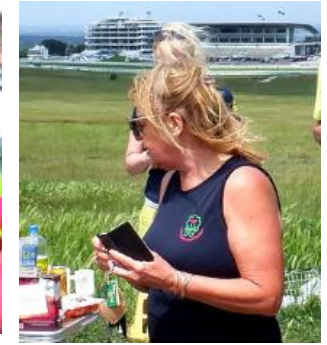
Beware of the black book