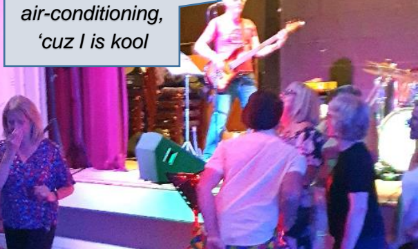
The band played on Saturday