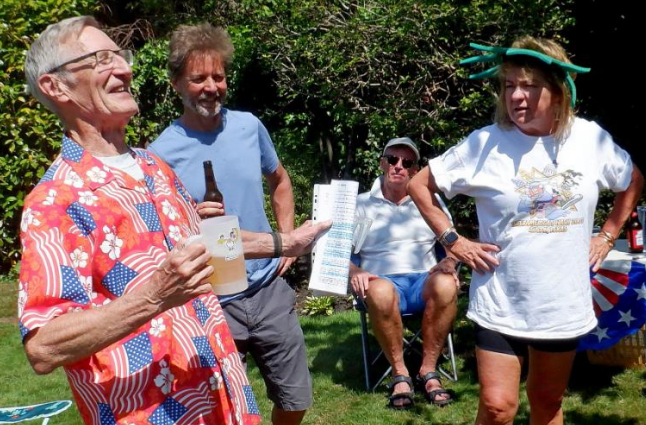
MANY MORE PICTURES IN Dropbox (rs2475 & pics)

We're free from you Pesky Brits! Or something like that.