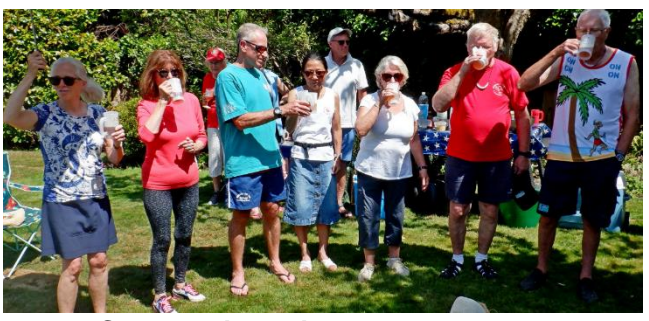
So more down downs