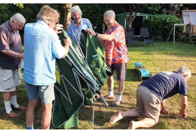
While the yoof of today attempt an erection, Popeye searches for a missing part