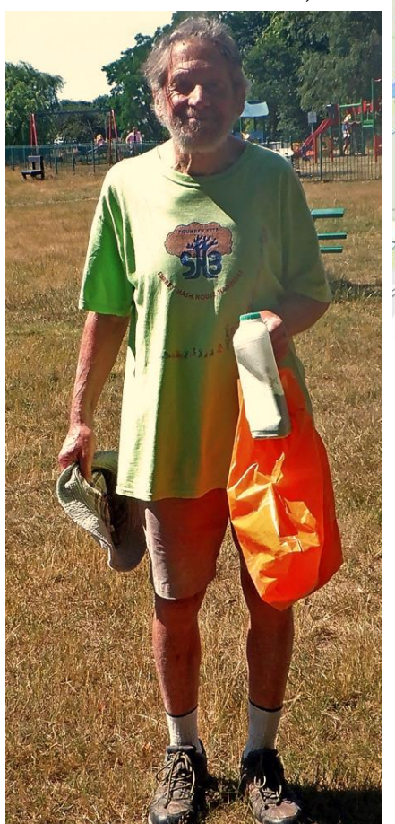
The Infamous Hare