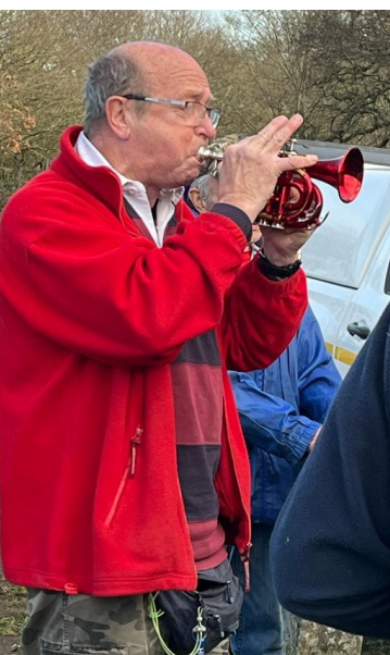
AND another thing!