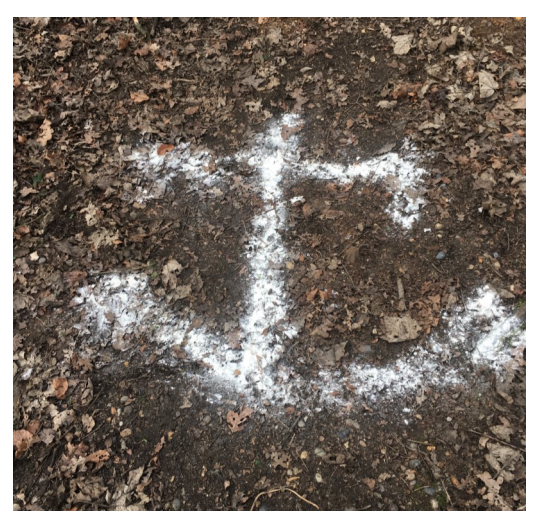
Popeye's HOME Anchor (age)