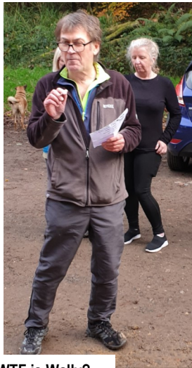
Spot the difference, AND... WTF is Wally?