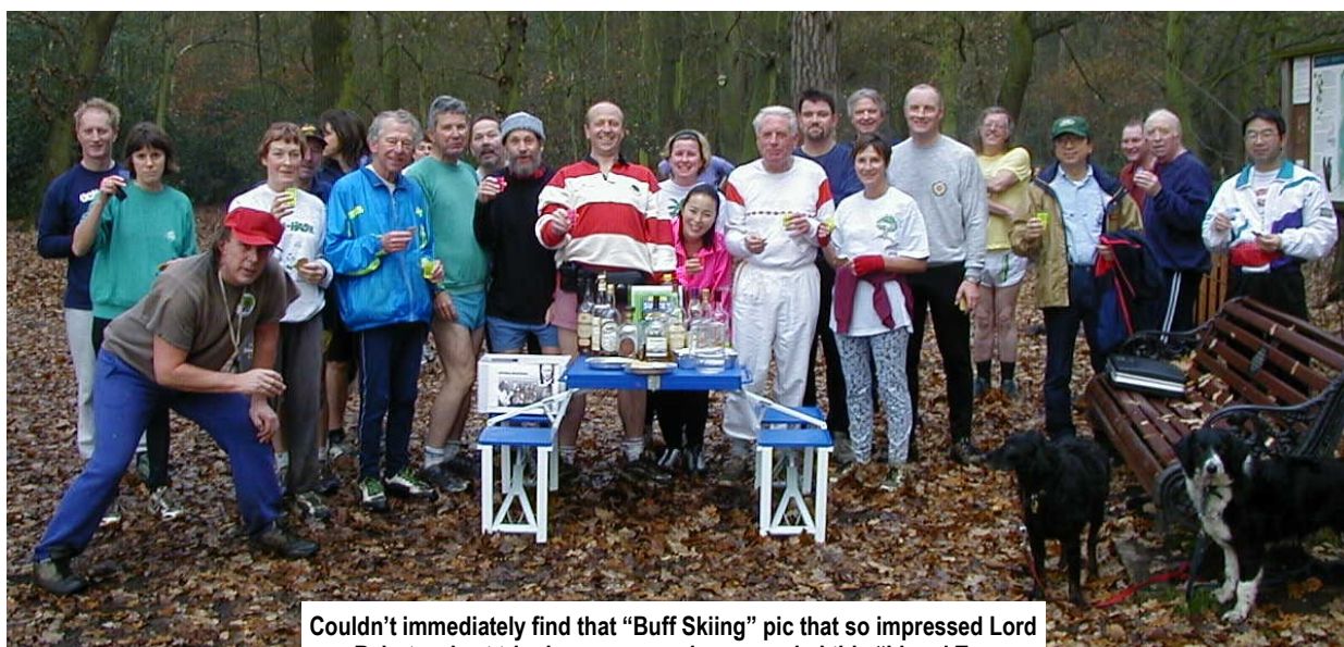
Couldn't immediately find that "Buff Skiing" pic that so impressed Lord R, but a short trip down memory lane revealed this "Lionel Tye Commemoration Whisky tasting" from 2001