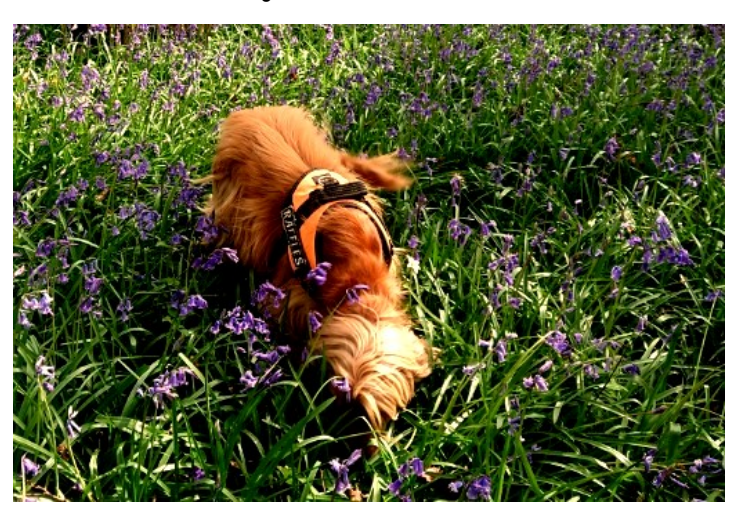
Raffles flouts laws on damaging Bluebells ! Unless of course they are those foreign upstarts.