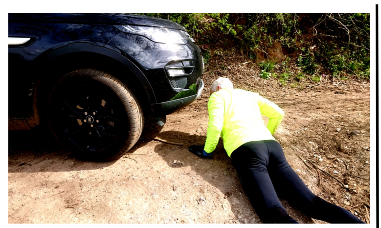
Caption competition..... Ok; you can email your entry, it was only a joke to ask for postcards!