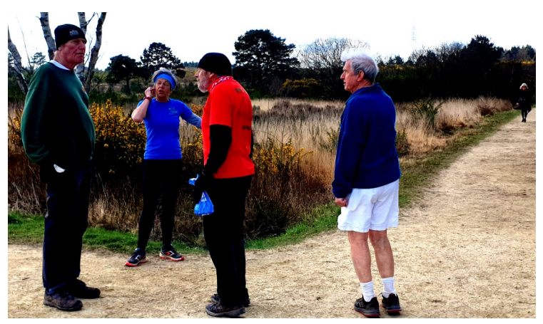
Caption competition...... Answers on a postcard please.